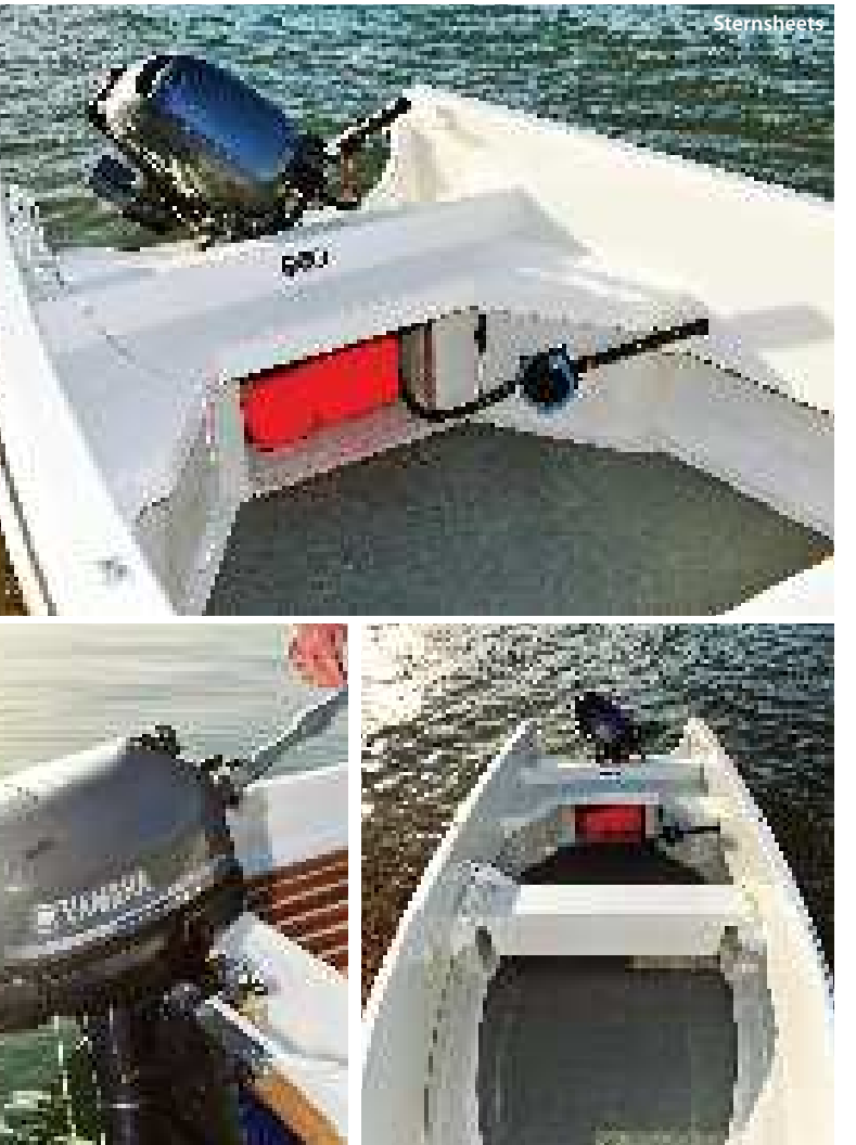
The new hull is super efficient and will