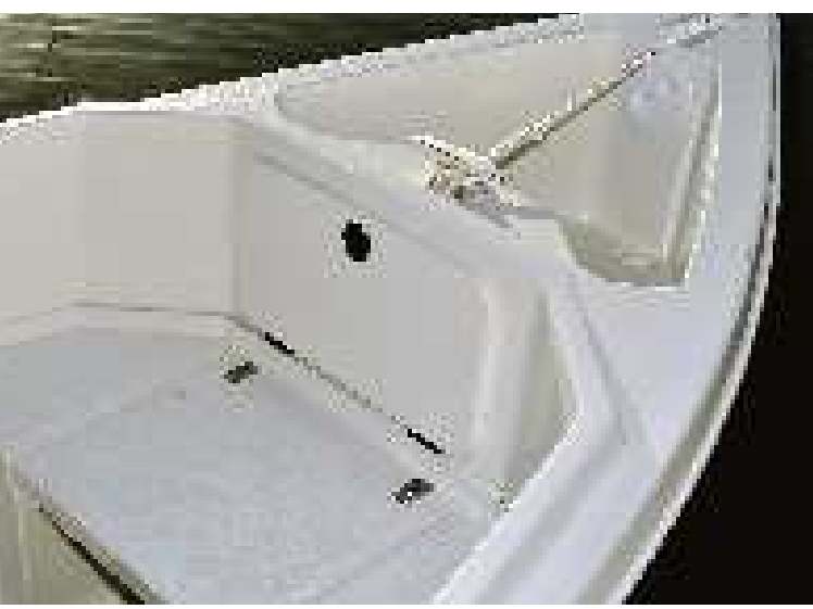
Built as an open boat there are ready made mouldins that can be retro fitted later to provide forward seating, a helm console and even a cuddy