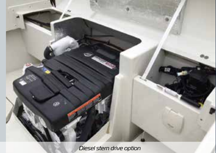
Diesel stern drive option