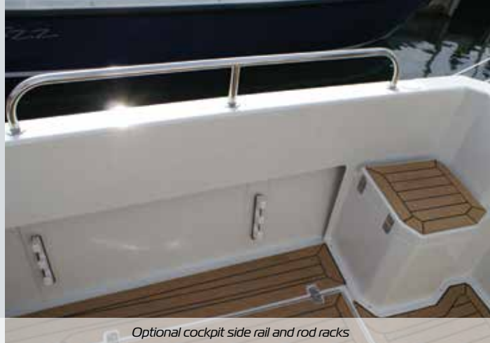
Optional cockpit side rail and rod racks