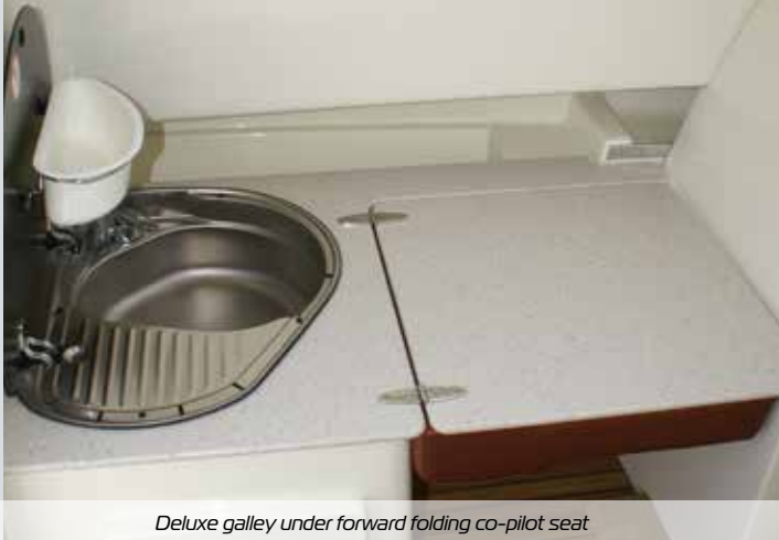
Deluxe galley under forward folding co-pilot seat