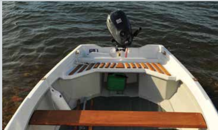
Hardwood centre thwart provides comfortable rowing position