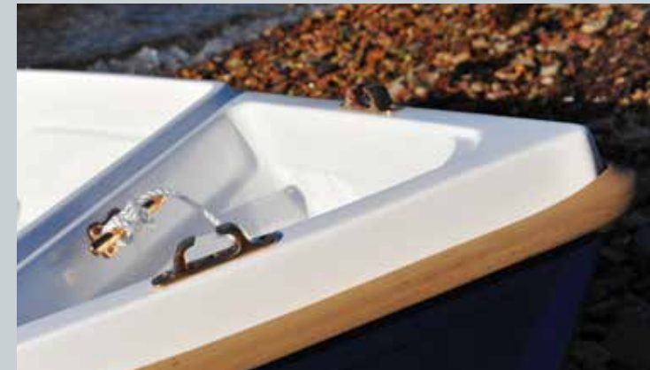
Elegant bronze fittings and teak effect fendering as per optional custom package