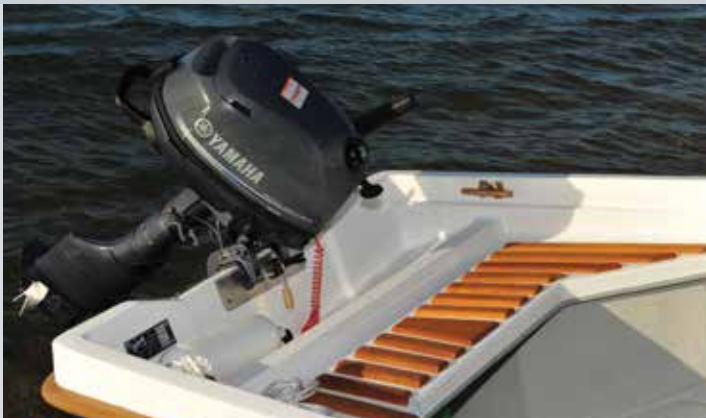
Suits up to 8hp longshaft engine