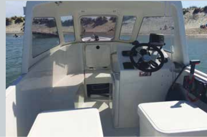
Spacious console with room for optional instruments