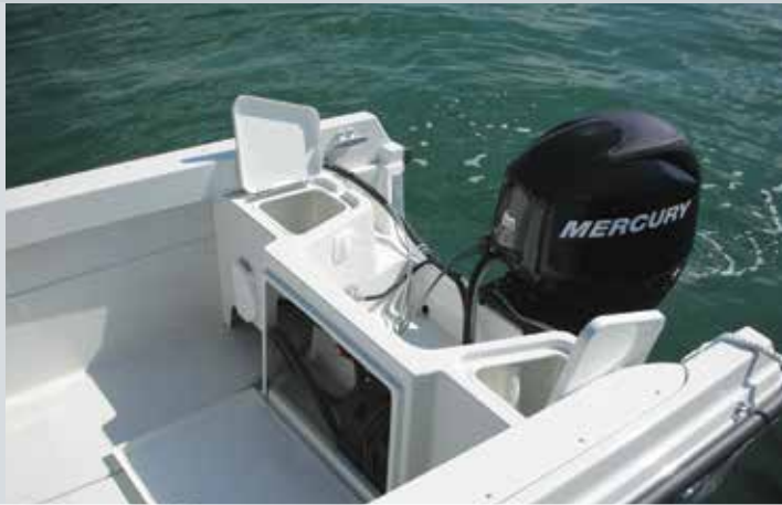
Integrated live bait well/stowage locker under aft seats

Standard boat in hand laid laminated GRP. Isophthalic resin is used in the hull which is stiffened below the waterline with a GRP girder system. The main under floor areas are foam filled and the cockpit is self-draining with a 26" interior freeboard. Stowage under the console and seat boxes. Under deck vented fuel tank locker and separate battery locker. Stainless steel winch eye and stemhead roller, mooring cleat and stern cleats. Tough all round PVC fender strip with stainless steel end caps. Fitted manual bilge pump. GRP side mounted console fitted with no feedback push pull wheel steering.