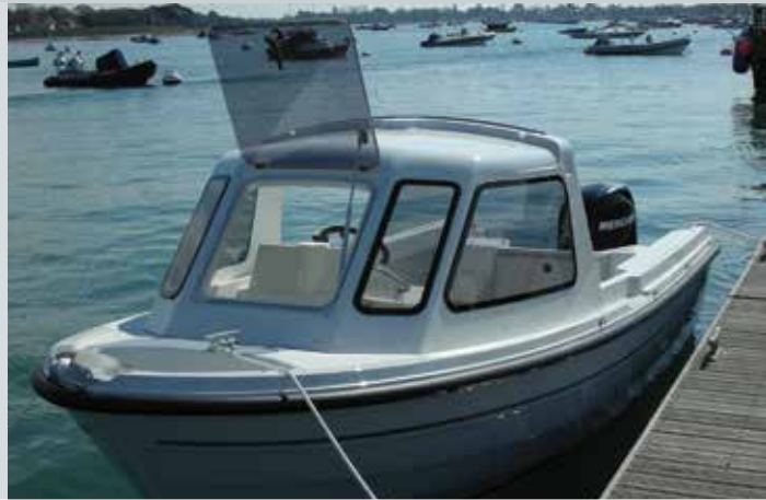
Optional stylish cuddy providing all round visibility and good shelter