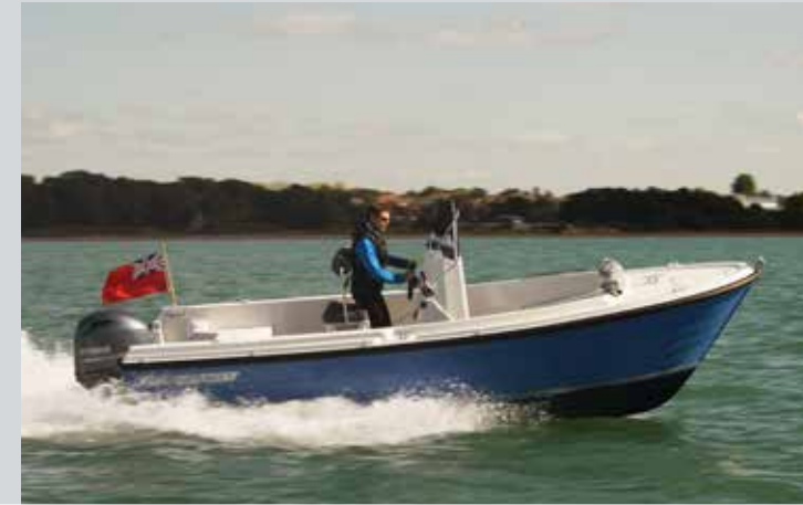
Boat available as standard open boat with several seat configurations