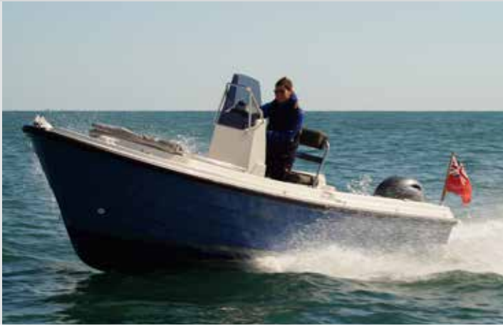
Moulded aft thwart with integral buoyancy under and space for fuel tank stowage

Standard boat in hand laid laminated GRP. Isophthalic resin is used in the hull which is stiffened below the waterline with a GRP girder system. The main under floor areas are foam filled and the hull and deck are bonded resulting in a high strength to weight ratio structure. The cockpit is self-draining with a 28" interior freeboard. Built in buoyancy is incorporated beneath forward and aft seating. An anchor well is forward with storage under and a moulded aft thwart with fuel tank and battery storage underneath is standard. Deck hardware includes bow and stern mooring cleats, bow roller and a stainless steel winch eye. A heavy duty all round PVC fender is fitted with stainless steel end caps. Fitted manual bilge pump & access inspection hatch to bilge.