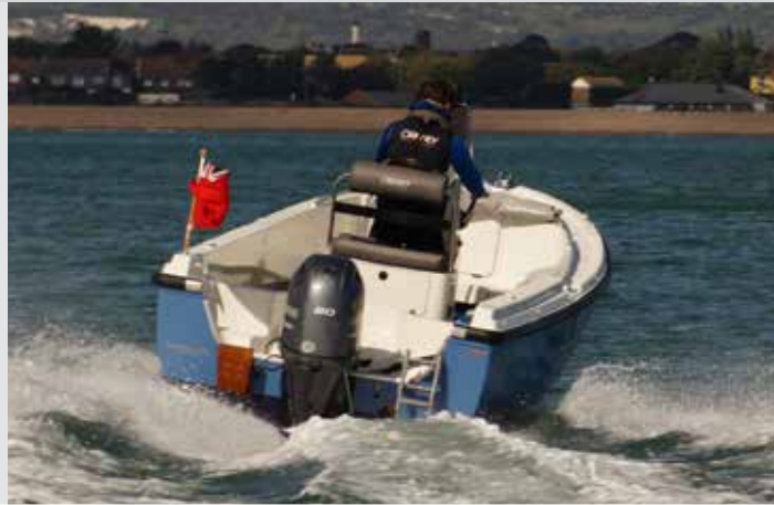
Anchor well with stowage locker beneath