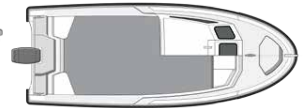
Fastliner 19 standard layout with optional cuddy