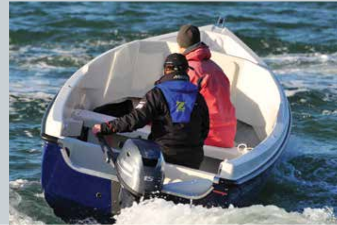
Boat available as standard open boat with several seat configurations