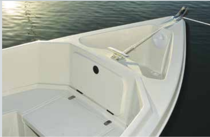
Anchor well with stowage locker beneath