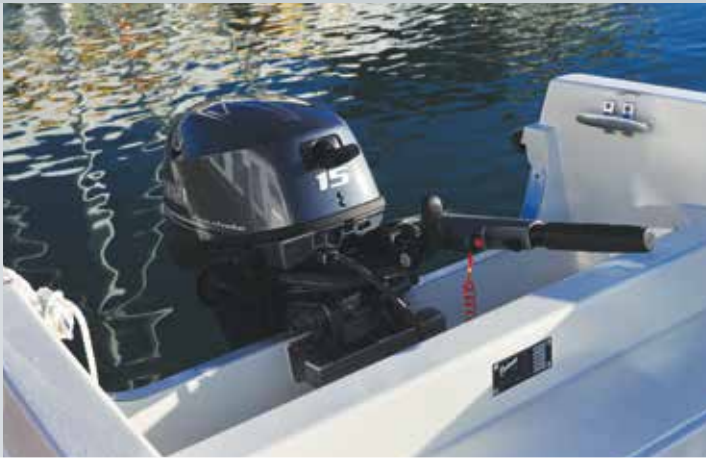
Moulded aft thwart with integral buoyancy under and space for fuel tank stowage

Hardware includes anodised alloy mooring cleats and bow roller, stainless steel winch eye and keel band.