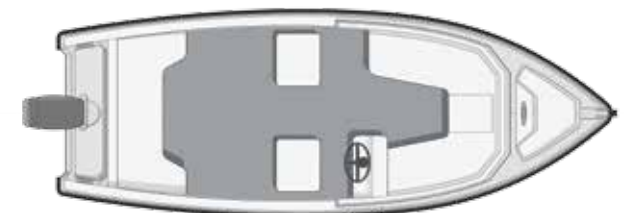
Plan showing optional components inc. seating and steering