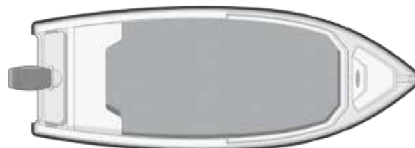
Standard layout (Tiller steer version)

Various different layout configurations are available on this model.