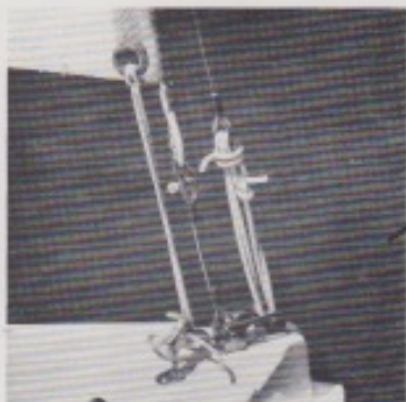
High quality stainless steel fittings and easily adjustable shrouds.