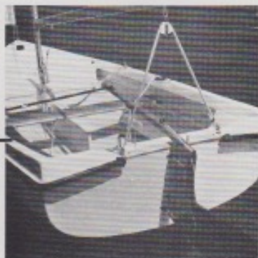
Straightforward rigging arrangement and modern fittings make the Skua a delight to sail.