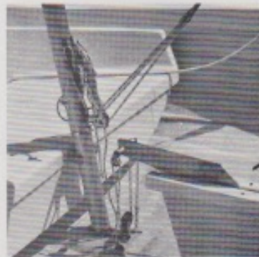
Well balanced galvanised steel centre plate, which is simple to adjust even when singlehanded.