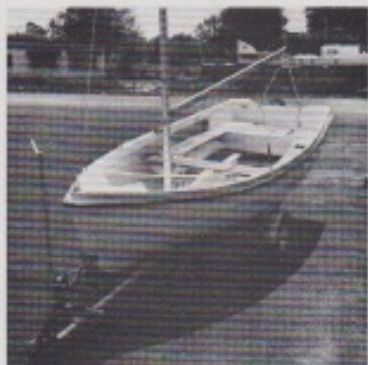
Purpose built road trailer means you can go anywhere you wish.