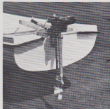
Transom constructed to take most leading makes of outboard motor.