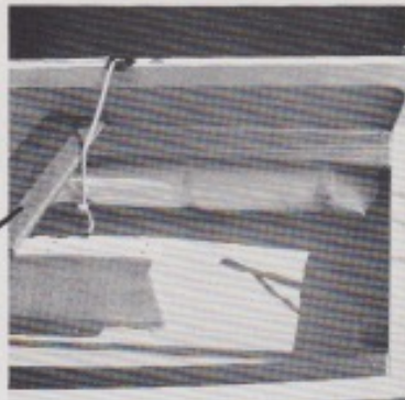
Large cockpit area with broad side benches under which the extra inflatable buoyancy bags are stowed.